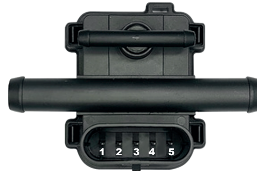
Sensor P1, M.A.P. and temperature 5P - 12V Compact Next