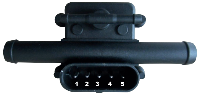
Sensor P1, M.A.P. and temperature Compact (2014)